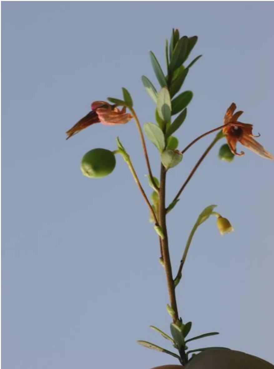
Figure 1. Treatment of 'Stevens' with ammonium thiosulfate to burn flowers. Note that open flowers were effectively burned, but fruit set from earlier flowers was unaffected.