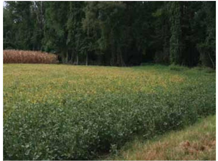
Figure 7. BMSB feeding injury to the periphery of a soybean field illustrating the “stay green” effect and contrasting with the unaffected, normally senescing plants at the center of the plot.

perimeter treatments and identifying BMSB densities needed to cause delayed plant maturity, the “stay green effect” (Figure 7). Results from insecticide trials conducted in VA and MD indicate that most labeled products provide control though further information including residual activity is needed. Several wheat fields in MD were reported to contain very high BMSB adults and one field yielded egg masses. Most adults were near the field edge, adjacent to wooded borders. Research on native stink bugs indicates that the most susceptible stages of wheat development are the milk and soft dough stages (Viator et al. 1983). This coincides with the stage of the wheat fields containing large numbers of BMSB adults. Adults from those fields laid many eggs over a very short time in the laboratory. In the absence of a more highly preferred host, wheat may be susceptible to BMSB, though more studies are needed to determine if BMSB poses a significant risk. High populations (> 3 per ear) were found on corn plants after the ear had started to form especially within the first 12 meters of field margins in DE. Unlike soybeans, perimeter treatments are generally impractical for treatment of late-stage corn. A pilot investigation in MD to determine how the surrounding landscape influences densities in field corn suggests that corn fields bordered by woodlots, other crops, and buildings have higher populations compared with fields bordered by roads.