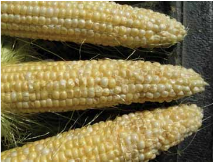
Figure 6. BMSB adult and nymphal feeding damage to sweet corn kernels.