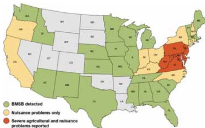
Figure 1. Distribution and impact of BMSB in the USA based on State records and BMSB Working Group assessments as reported by May 2012. In addition, at least one unofficial detection has been made in CO.

General Biology. Adults are distinguished from other brown stink bugs in the USA by their larger size, light colored banding on the antennae and legs and alternating light and dark bands around the abdomen (Figure 2). The term 'marmorated' means having a marbled or streaked appearance. Females emerge with undeveloped ovaries and must feed before mating. Once mated, females lay light green egg masses of ~28 eggs on the undersides of leaves. Depending