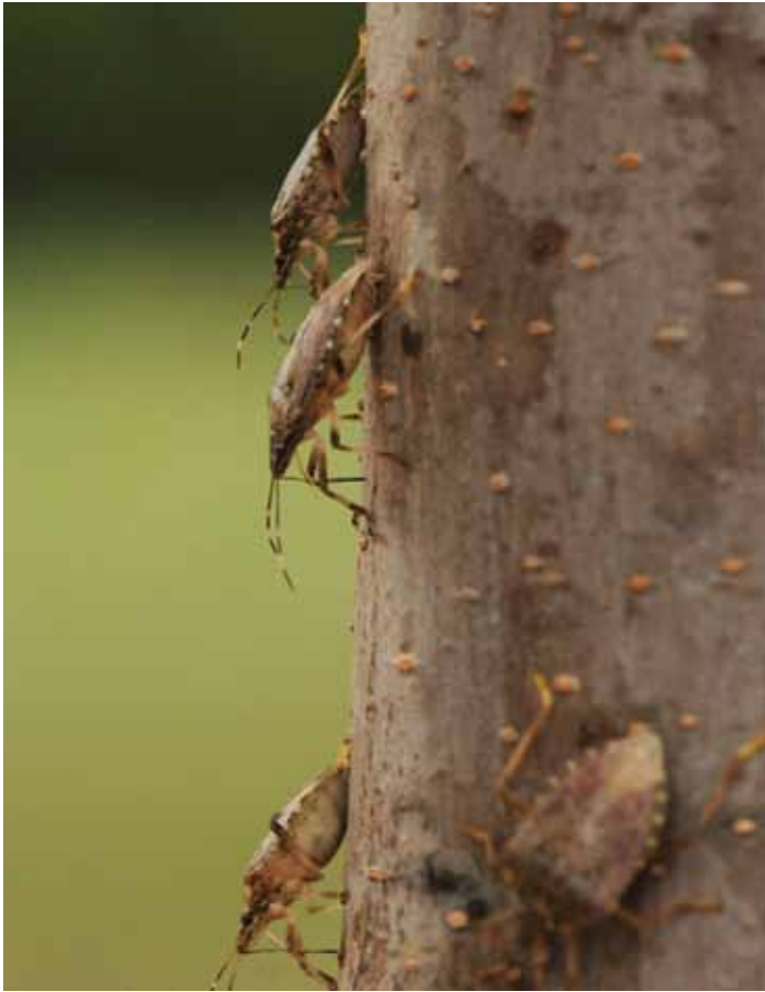
Figure 8. Adult BMSB feeding on the trunk of a London plane tree, Platanus × acerifolia .

floors with their frass, and activity due to their attraction to light and moisture especially as temperatures warm (Inkley 2012). Their nuisance impact is well-documented by an enormous volume of requests for information on the biology and management of this pest at web sites and telephone hot lines maintained by state government agencies and institutions. Since 2004, a Rutgers University web-reporting site has received 10,000 BMSB reports and Pennsylvania State University's BMSB online fact sheet has been viewed more than 600,000 times since 2008 (Jacobs, personal communication ). In 2010 and 2011, University of Maryland's BMSB web page received more than 80,000 visits, while email and phone contacts addressed approximately 900 inquiries (Traunfeld, personal communication ) and a self-help YouTube for consumers generated about 1,300 hits per month since posting in 2011. Distinct autumnal peaks of reports/visits clearly defined the annual activity pattern of BMSB as they begin to enter homes in mid-September. Additional web activity occurs in January-April.