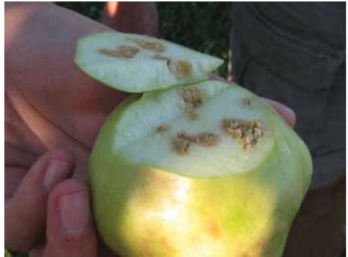
Figure 3. Internal injury to 'Pink Lady' apple as a result of BMSB feeding.

Orchard Crops. In Asia, BMSB is an outbreak pest of tree fruit (Funayama 2002). Damage to tree fruit in the USA was first detected in Allentown, PA and Pittstown, NJ (Nielsen & Hamilton 2009b). In orchards where BMSB is established, it quickly becomes the predominant stink bug species and, unlike native stink bugs, is a season-long pest (Nielsen & Hamilton 2009b, Leskey et al. 2012b). In 2008–2009, increasing BMSB populations in WV and MD caused late-season problems to fruit crops (Leskey & Hamilton 2010a). In southern PA and VA, BMSB was not a recognized pest until the 2010 season. However, injury to apple (Figure 3) was probably mistaken for physiological disorders such as cork spot and bitter pit. Severe pest pressure in 2010 resulted in $37 million in losses to mid-Atlantic apples alone (American/Western Fruit Grower 2011) with some stone fruit growers losing > 90% of their crop (Figure 4, Leskey & Hamilton 2010b). In 2011, damage, though not as severe, was observed