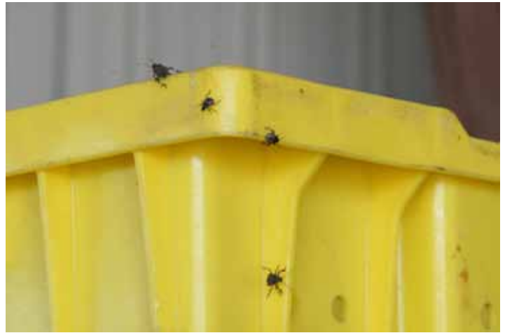
Figure 5. BMSB nymphs crawling from a container of machine-harvested blueberries highlighting the problem of contamination at harvest.

Small Fruit. Little is known about the impact of BMSB in small fruit crops. Research is underway to establish the impact of BMSB feeding, determine BMSB phenology, and to identify landscape and temporal risk factors associated with BMSB on small fruit crops. In blueberries, BMSB was first observed during the late-season in 2010, and many NJ blueberry growers have since reported it in and around structures and houses. Contamination risks are a great concern to blueberry growers who mechanically harvest and then sell to processors or ship to other countries and regions within the USA (Figure 5). During 2011, BMSB populations in NJ blueberry farms remained low and did not require control measures. In caneberries, stink bug species cause two types of injury. Although not thoroughly investigated, it appears that early