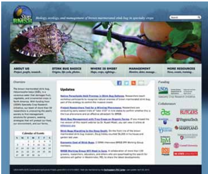
Figure 10. StopBMSB.org, the web site for the USDA-NIFA SCRI coordinated agricultural project.