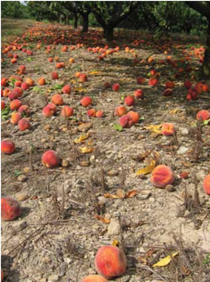
Figure 4. 'Red Haven' peaches stripped from trees by a MD grower and left to rot because of ~100% BMSB injury in July, 2010.

a wider range of grape cultivars and possible mechanisms of resistance. Management programs in grapes that do not rely on pyrethroids are needed to avoid secondary outbreaks of grape mealybug, the vector of grapevine leafroll virus. As for potential taint of wine, controlled inoculation (as many as 25 BMSB/11.3 kg fruit) of juice/mush has not resulted in perceptible taint/aroma following fermentation; chemical analysis is in progress (J. Fiola, unpubl. data). Effective means to remove BMSB from clusters just before harvest were established in VA, lessening the risk of tainted wine. Additionally, large numbers of BMSB adults seeking overwintering sites damage the ambiance of commercial wine tasting rooms.