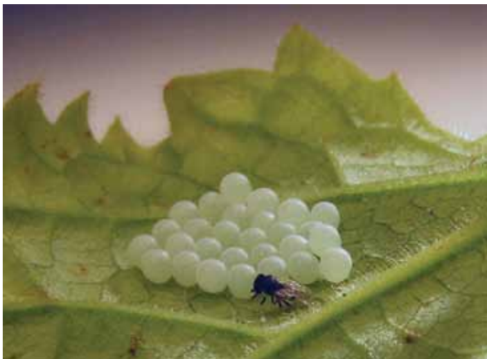
Figure 11. Adult Trissolcus female attacking eggs of BMSB.

the Working Group and available on the Northeastern IPM website has resulted in > 16,000 visits since 2010. Successful grant initiatives that have cited priorities defined by the Working Group include the USDA-NIFA Critical Issues and Northeastern and Southern Regional IPM grants. In addition, a national coordinated agricultural project funded by USDA-NIFA Specialty Crop Research Initiative is studying the biology, ecology, and management of BMSB in specialty crops. This project includes over 50 researchers from 10 states and includes a national outreach program that specifically targets growers. The Northeastern IPM Center leads this national outreach effort. A website, StopBMSB.org, (Figure 10) serves as a hub for delivering BMSB management information and providing knowledge emanating from the project’s research program, links to key BMSB resources, and provides “the best of” current information with an eye toward adding value for growers. The United Soybean Board has funded a multi-state research project to develop information on impact by and management of BMSB in soybeans.