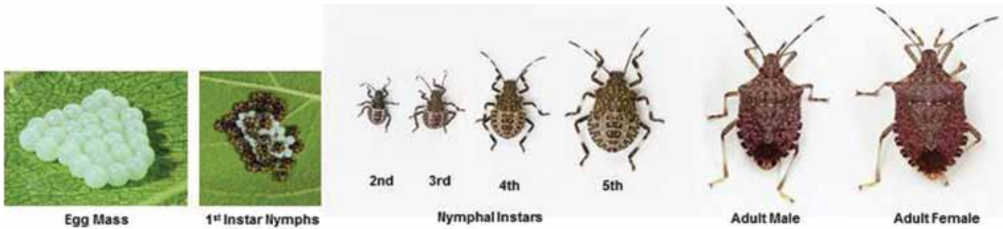
Figure 2. BMSB life stages.

on temperature, eggs hatch in 3–4 days. Nymphs go through 5 instars. First instar nymphs are reddish and black in color and stay with the egg mass until they molt to the second instar at which time they seek food sources. Nymphs darken and express pronounced light and dark banding on their legs and antennae (Hoebeker & Carter 2003).